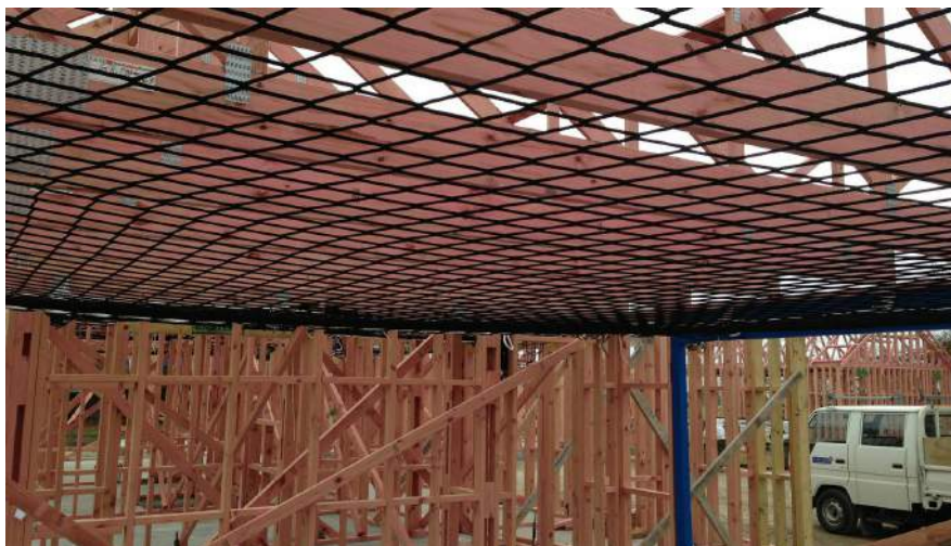
Figure 3: Illustrative use of netting – potential overkill?