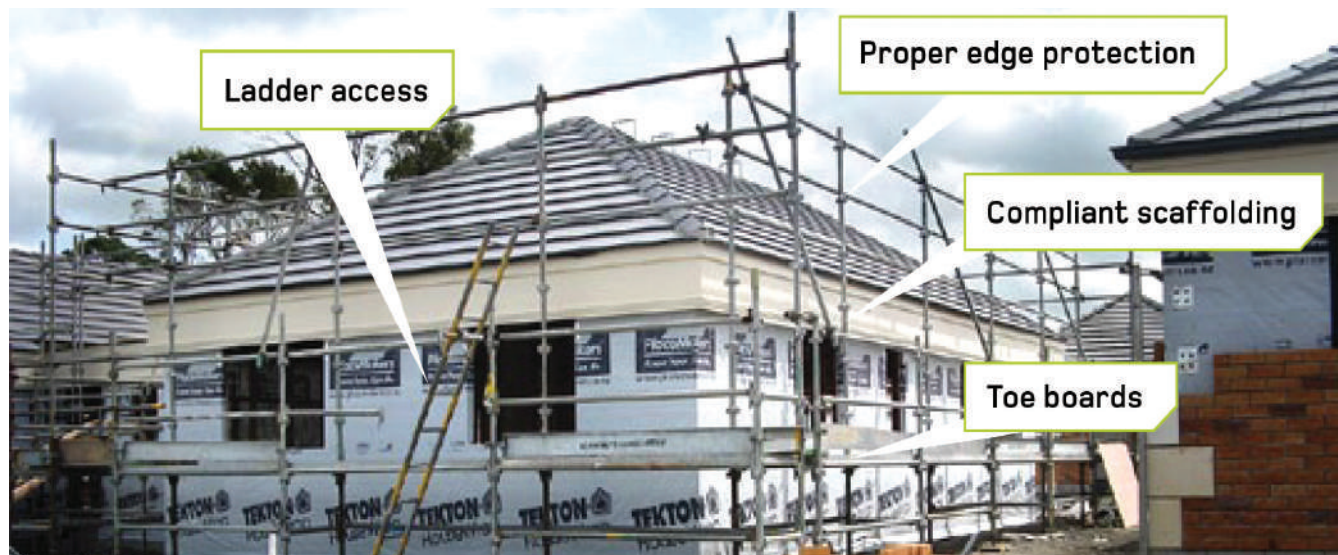
Figure 2: Nice to have, but who is paying – Illustrative scaffolding for a single-storey residence